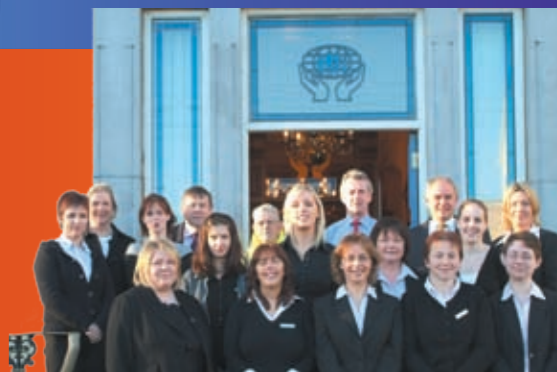
St. Jarlath's Credit Union Staff

An AED is a heart machine used to revive people whose heart has stopped beating, also known as Cardiac Arrest.